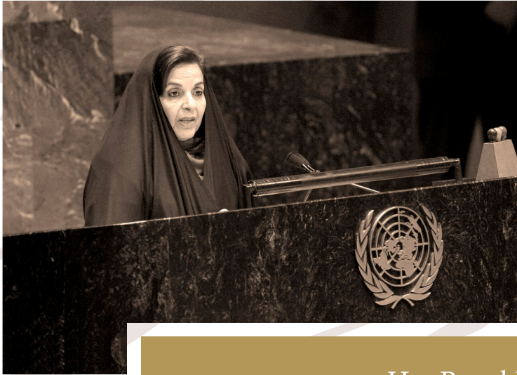
Her Royal Highness Princess Sabeeka Bint Ibrahim Al Khalifa