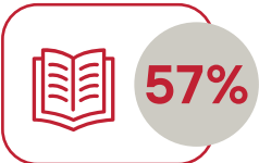
Percentage of Bahraini women academics in higher education institutions