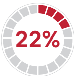
Percentage of Bahraini women ministers in the Government