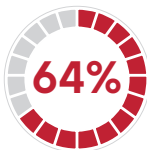
Percentage of Bahraini women's participation in specialized positions in the Government Sector