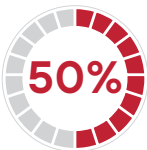
Percentage of Bahraini women's participation in executive positions in the Government Sector