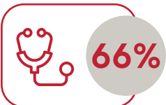
Percentage of Bahraini women physicians