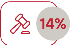
Percentage of Bahraini women judges