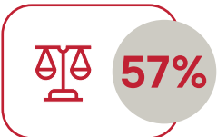
Percentage of Bahraini women lawyers