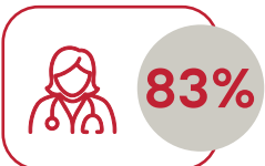
Percentage of Bahraini women nurses